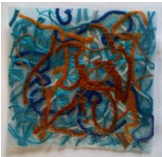
Using chunky threads and sheer fabric top and bottom.

You can experiment further using sheer fabrics top and bottom, chunky threads, painted bonda web and some machine stitching.