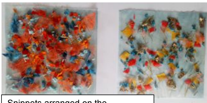
Snippets arranged on the