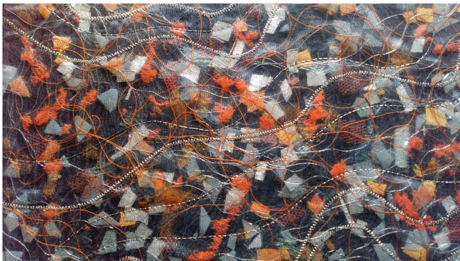
With the addition of machine stitching